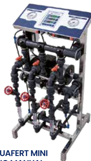
AQUAFERT MINI VISIO MANUAL

* programmer and pH and EC probes not included