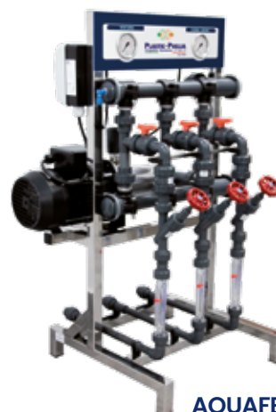
AQUAFERT MINI MANUAL